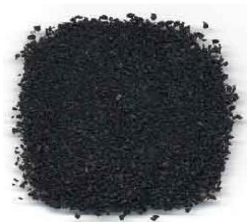
Fig.2.3. Rubber granules that used in concrete

Stiren Butadiene Rubber are manufactured from tires of used the idle truck, bus and truck by separating the fragmented textile and steel using crushers with mechanical blade. Used SBRs are illustrated in the Figure 2.3.