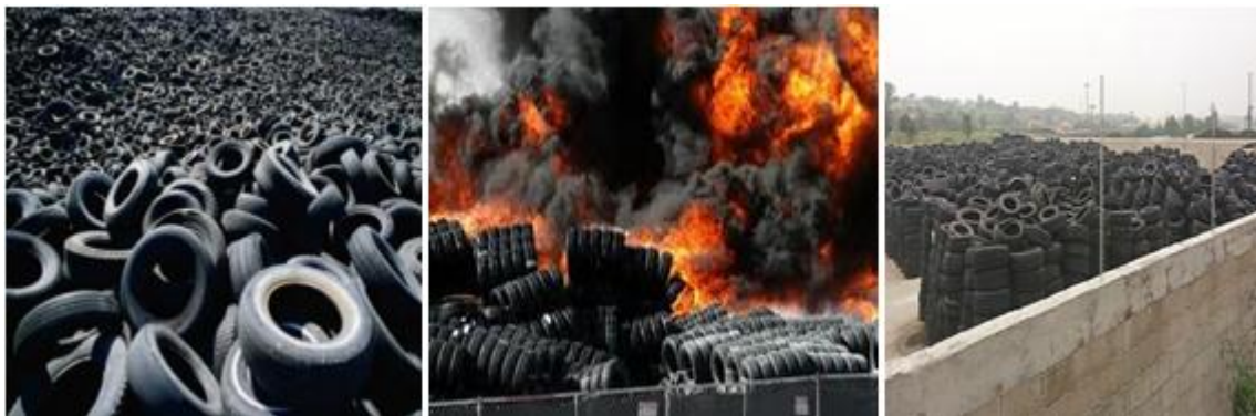
Fig.1.1. Waste tires and environmental pollution

Our country is among the developing countries at all points. While rapid but patchy urbanization occurs, the substructure of the city gets behind in rapid urbanization. Rapid and unplanned urbanization in the country has brought considerable social and administrative problems with population explosions in some cities and increase in the number of vehicles. The most important of these problems are excessive fuel consumption, environmental pollution; accidents transportation difficulty and traffic jam whose social cost is high [1]. According to increasing in number of vehicles, the amount of waste tires was increased. Due to increasing of amount of waste tires environmental pollution was increased (Fig. 1.1).